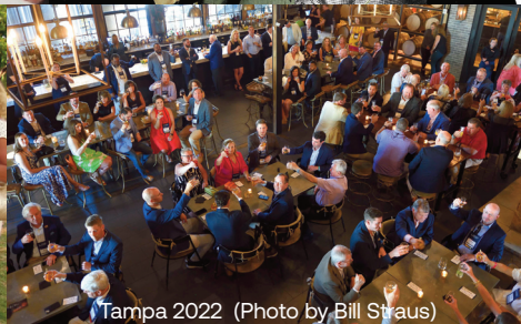
Tampa 2022