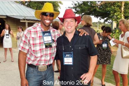
San Antonio 2012