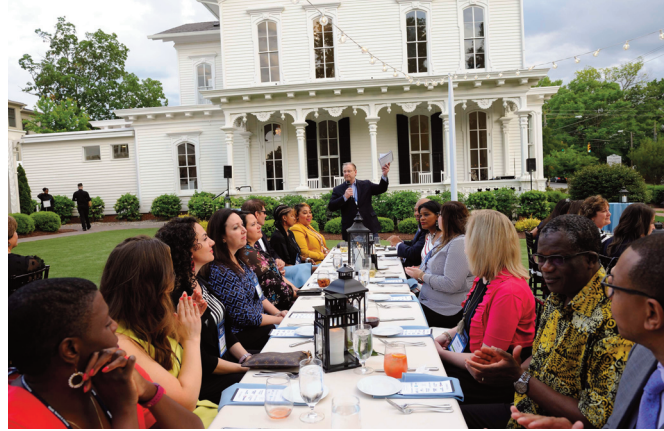
Raleigh, N.C. 2019

For nearly a quarter of a century, the Bank Reception & Dinner has been a staple of Commerce Lexington's Leadership Visit. This unique event supported by our area banks has enabled us to enhance the camaraderie and bolster relationship-building during the trips. Prior to the creation of the event, individual companies would invite people to their own dinners, which went against the intended collaborative spirit of the intercity visits. The Bank Dinner enables everyone to come together and be included for an evening of networking and fellowship as we get to know each other better.