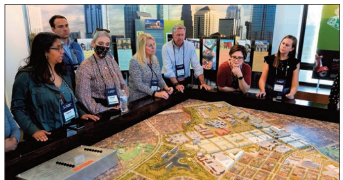
One of the elective tour options took people to the Mueller Central development in East Austin.