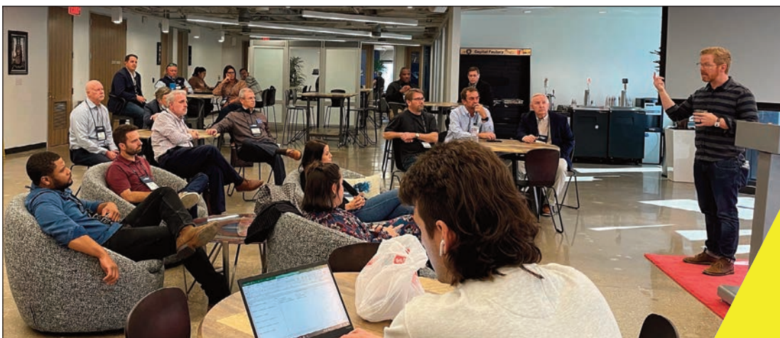
A group of Leadership Visit participants got a VIP tour of Capitol Factory during Monday’s elective options. Capitol factory is home to hundreds of startups working in software, hardware and innovation. It is referred to as “the center of gravity for entrepreneurs in Texas.”