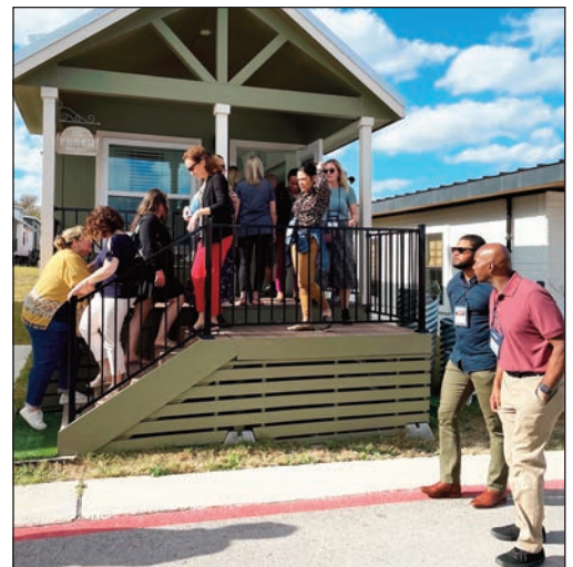
Leadership Visit attendees had the opportunity to experience a guided kayak tour on Lady Bird Lake (left) and a tour of Community First Village (right) for people facing chronic homelessness.