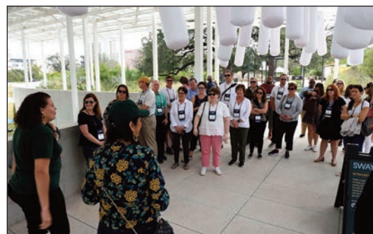
PHOTOS BOTTOM ROW: One of the elective tour groups visited the recently-opened Waterloo Park in downtown Austin, which has some similarities to Lexington's planned Town Branch Park. Waterloo Park is a public-private partnership between the City of Austin and the Waterloo Greenway Conservancy.