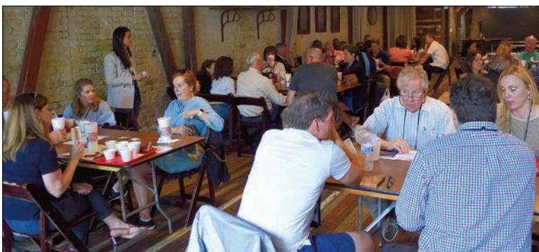
A group of Leadership Visit attendees participated in an Engagement Lunch at Cooper's Old Time Pit BBQ.