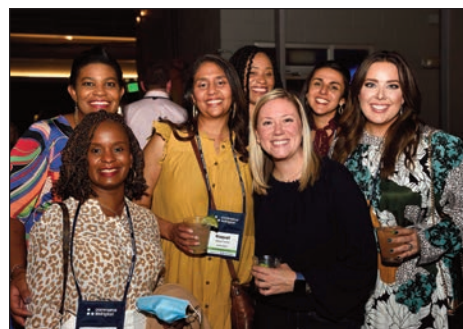
PHOTOS TOP ROW: The Opening Night Reception sponsored by Baird was held at The Container Bar, an innovative space constructed from seven shipping containers.