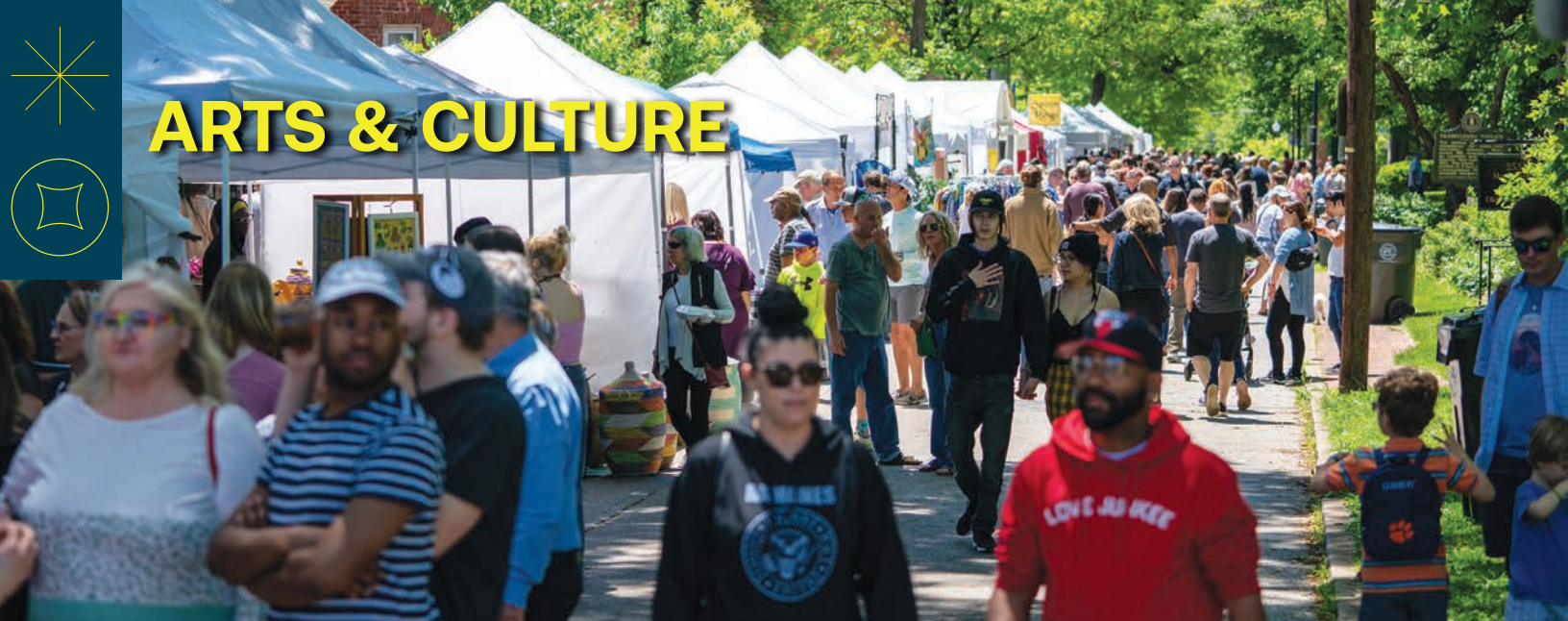
Mayfest Arts Fair (May 11-12, 2024) is a juried art fair with a focus on a casual, family-friendly atmosphere. Included are up to 100 Artist Vendors, performances by musicians, dancers, strolling performers, food concession vendors, and family activities.

Whether you're in the mood for great musicals, national and international museum exhibits, art galleries, charming children's productions, outdoor performances, or touring Broadway plays, Lexington hosts a variety of arts and cultural opportunities that fit many interests. Leading the way for the advancement of the arts locally is LexArts, Lexington's cultural development, advocacy and fundraising organization. LexArts provides a wide range of programs and services designed to integrate the arts into our community. Through its annual Fund for the Arts, LexArts raises millions of dollars in support of local arts and distributes general operating support to its partner organizations, as well as offering competitive special project and programming grants to other arts organizations in the area.