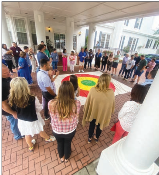
The Leadership Lexington class participated in a team-building activity during the recent Orientation Retreat at Boone Tavern.

The Leadership Lexington Orientation Weekend was a resounding success, enriching each