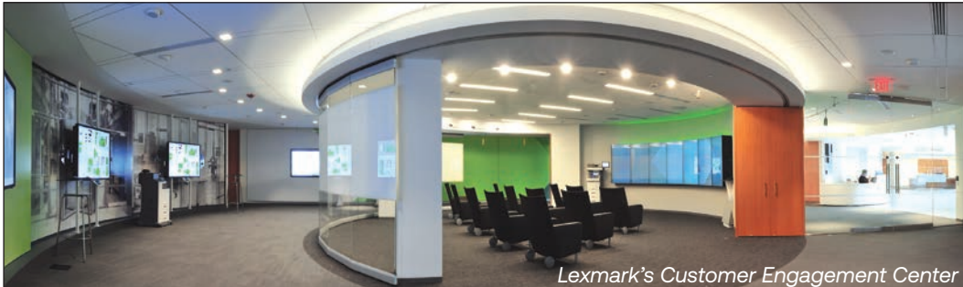
Lexmark's Customer Engagement Center

Commerce Lexington's Business Link after hours events are all about networking and building your client base, and what better way to do that than inside Lexmark International's innovative Customer Engagement Center (CEC). Bring plenty of business cards, and be ready to network your way to success at Business Link on Tuesday, September 19 , from 4:00 - 6:00 p.m. at Lexmark (740 W. New Circle Road). Lexmark's Customer Engagement Center offers an interactive experience for customers and helps them find solutions to their office's business challenges.