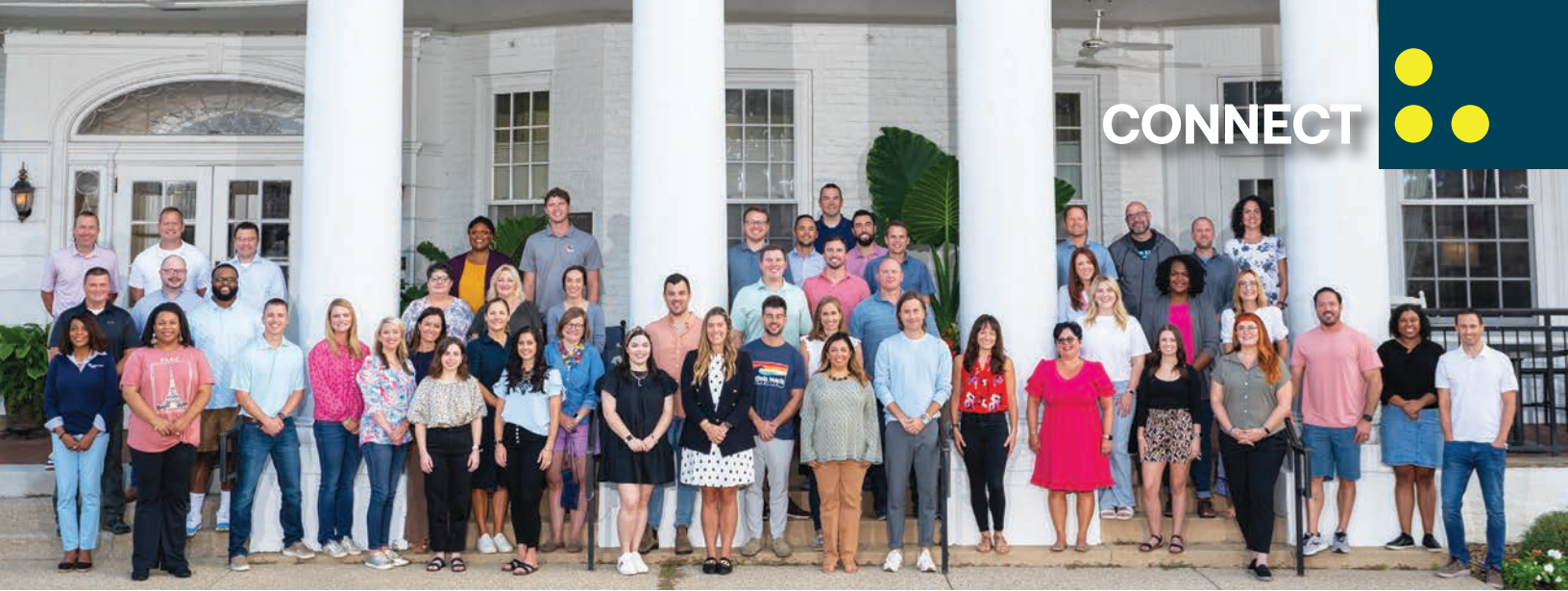
Leadership Lexington 2023-24 Class Photo at Orientation by Mahan Multimedia.