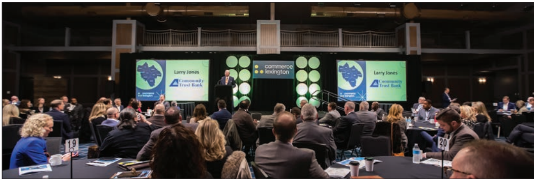
2022 Regional Summit