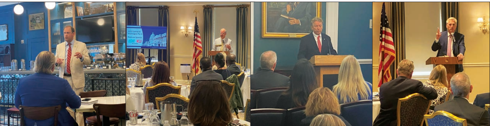
Congressman Andy Barr