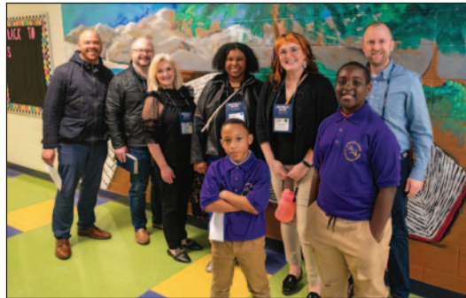
During Education Day, Leadership Lexington class members toured William Wells Brown Elementary.

The group relocated to the Nutter Training Facility on the campus of the University of Kentucky. We were treated to a tour of the new track facility and