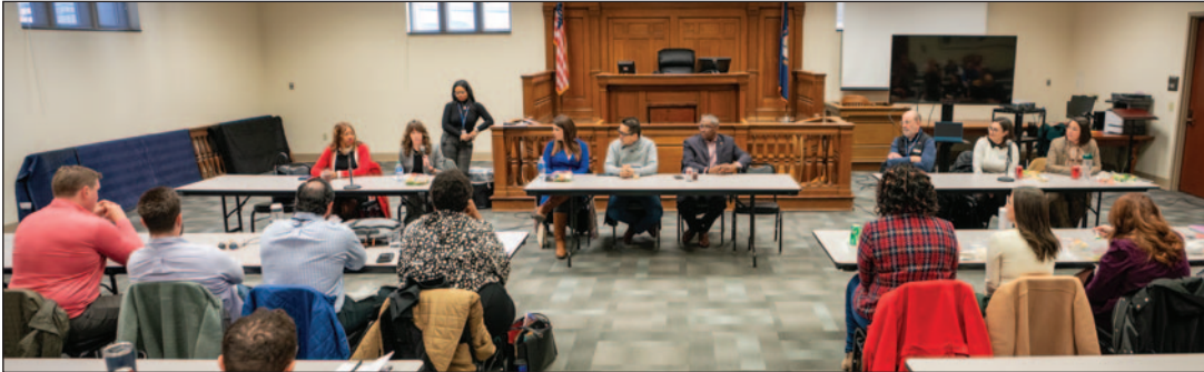
During Government Day, Leadership Lexington class members had a discussion with Lexington city councilmembers.