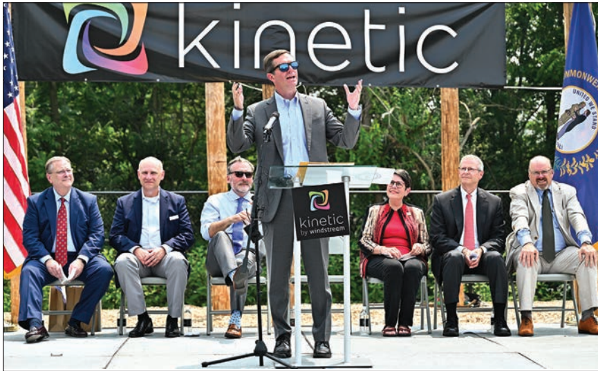
Local and state officials gathered on June 28th to mark the grand opening of Kinetic by Windstream's regional headquarters in Coldstream Research Campus.