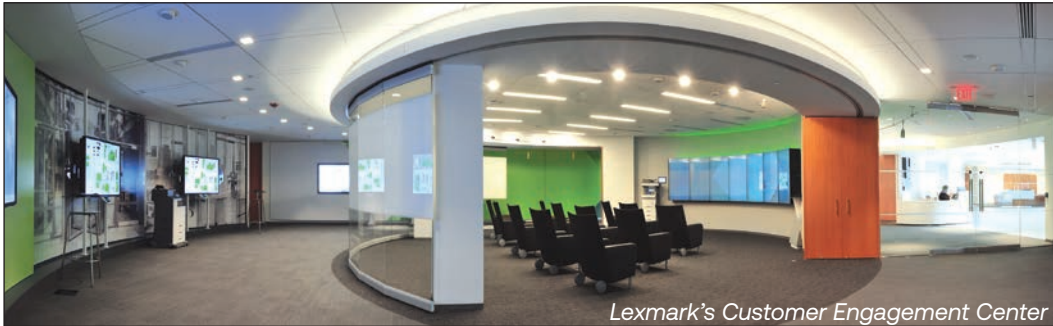
Lexmark's Customer Engagement Center

Commerce Lexington's Business Link after hours events are all about networking and building your client base, and what better way to do that than inside Lexmark International's innovative Customer Engagement Center (CEC). Bring plenty of business cards, and be ready to network your way to success at Business Link on Tuesday, September 19 , from 4:00 - 6:00 p.m. at Lexmark (740 W. New Circle Road). Lexmark's Customer Engagement Center offers an interactive experience for customers and helps them find solutions to their office's business challenges.