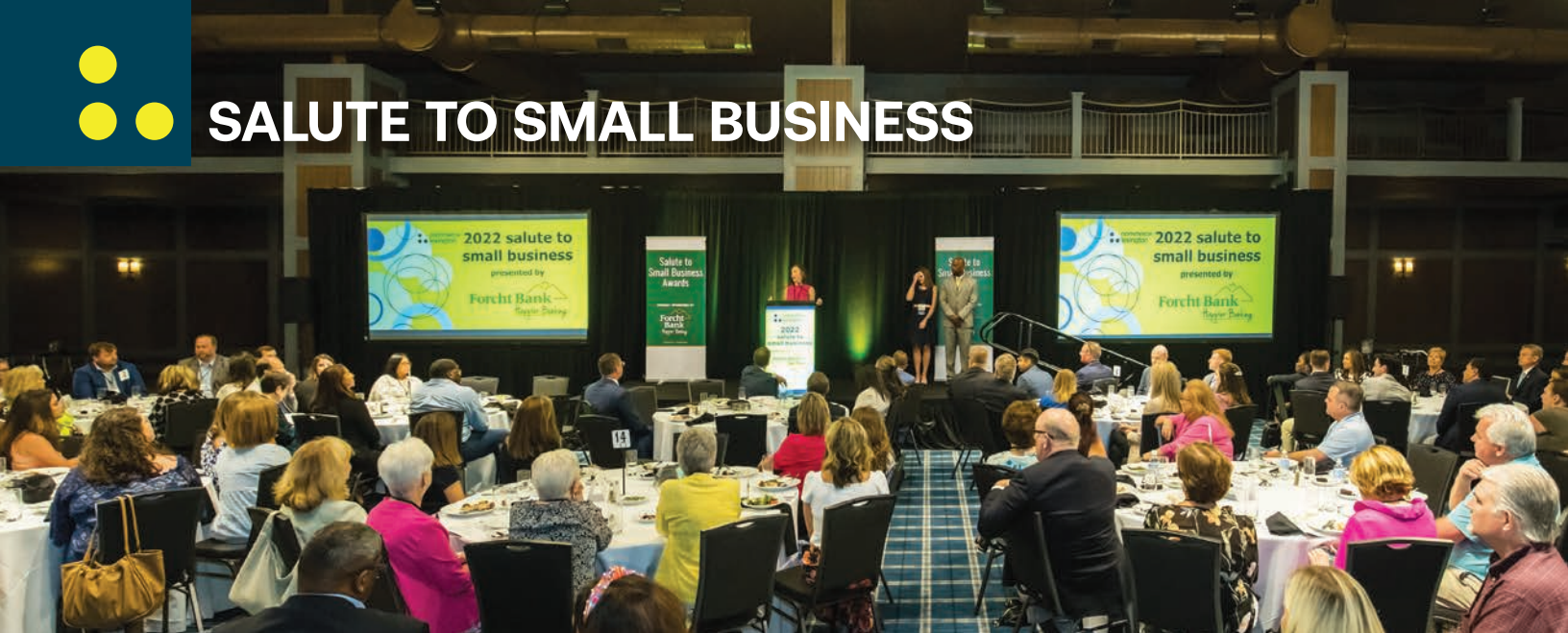
Photo from 2022 Salute to Small Business Awards Luncheon.