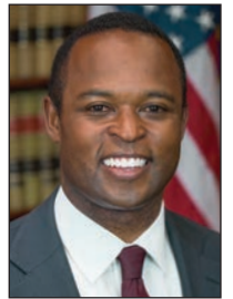
ATTORNEY GENERAL DANIEL CAMERON

Mr. Cameron is the 51st Attorney General for the Commonwealth of Kentucky. He is the first African American independently elected to statewide office in Kentucky's history and the first Republican elected to the Attorney General's office since 1948. Prior to his election as Attorney General, Cameron practiced law in Frost Brown Todd's Louisville office.